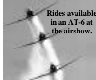
Rides available in an AT-6 at the airshow.

The Belle will be arriving on Monday Aug. 11 and will be parked on the tarmac for visitors to photograph. Hopefully there will be a media flight for the news media to experience the feel for this historic bird. It will also be at the airshow and will be flying for the crowds. However this will be the restored airshow version of the Memphis Belle.