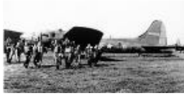
Jubilant crew of the first B-17 to complete 25 missions during WWII