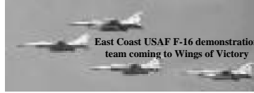
East Coast USAF F-16 demonstration team coming to Wings of Victory

Contact the hangar 740-653-4778 or Barb Seymour to volunteer. The airshow succeeds because of all of our volunteers. Take pride in being one of them.