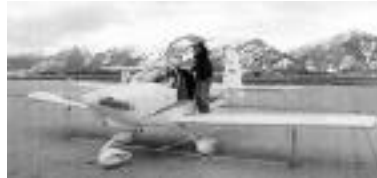
preparing to assault the mountains